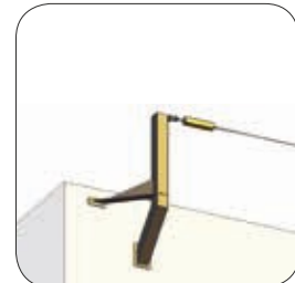
Wall attachment with specially tailored post